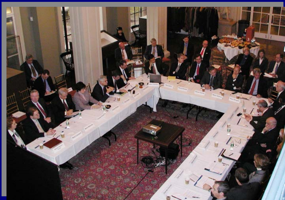
Life Sciences leaders from industry, academia, and government convene at the Boston Athenaeum for the first meeting of the LSC, December 6 th , 2006

“A flexible and dynamic entity committed to sustain global leadership and innovation of the life sciences industries in the Commonwealth through enhanced collaboration.”