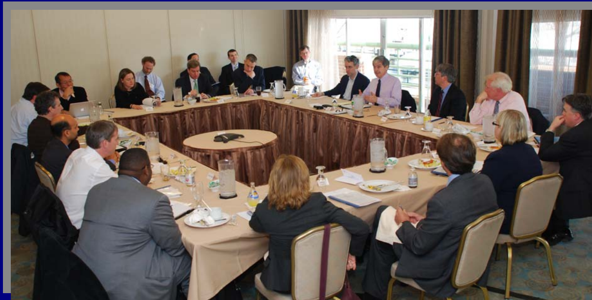
Members of the Organizing Committee gather at the kick-off meeting on February 11 th , 2009